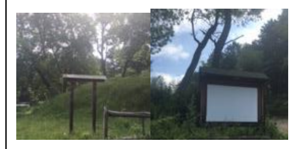
Figure 2: Examples of lack of maintenance of hiking trails in and around Berovo

There are some hiking routes in Berovo and Pehcevo but there is a need for more variety and connection of routes. Current infrastructure near some of the trails needs repair. The local mountain club in Berovo is very active and has set out and marked several trails varying in length and difficulty. This is partly done through a grant from the Macedonia Tourism Agency. There is a large map near the reception at Hotel Manastir and the reception provides printed maps