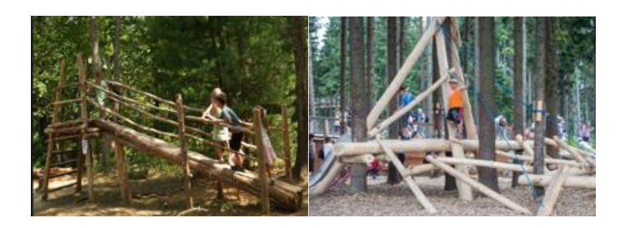
Figure 3: Examples of natural style play areas

Aurora Resort and Bela Voda offer limited activities for families traveling with children. Both the regional and domestic short break tourists often travel with families including young children and teenagers. Offering activities geared towards these markets would increase their length of stay and also improve the attractiveness of the area outside the summer months.