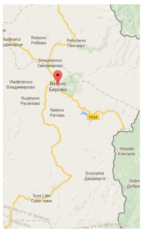
Figure 1: Map of Malesevo

The 'destination' is not defined by administrative boundaries, but rather by key elements that make up a destination from a visitor perspective. This destination therefore includes the natural, cultural and man-made attractions, facilities, services and resources that make up this particular hub of tourist activity, centered around Berovo and Pehcevo. This destination therefore includes tourism assets in these municipalities but also in smaller villages within a one hour driving distance. The attractions in these nearby areas are often visited during the same trip.