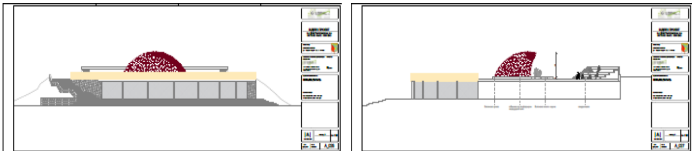
Figure 7 The Plateau of the Memorial-ossuary (view of the summer scene)

We point out that the new contents do not touch, change or damage the existing monument as an object – neither the monument nor its purpose. With the realization of this project, which implies re- slab the plateau, we protect the building itself from its decay and destruction. The municipality takes into account the current state of the building for which considers that revitalization is the most important procedure that needs to be done in order to protect the existing object and cultural heritage, as well as the tradition and values that are embedded in it. Memorial monument, the so-called Memorial ossuary was built in the fifties of the last century but with time, due to negligence a certain part of the centuries-old traditional has been ruined. In the frames of the entire complex Kitino Kale, an abandonment is present in some of the towers of the castle as a fortress.