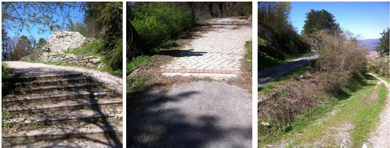
Figure 3 Remains of the medieval tower