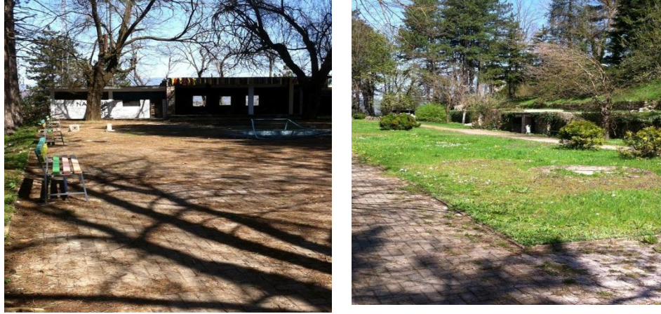
Figure 1 and Figure 2 The current state of the plateau in front of the object

stone and seedlings. The arrangement of the access paths including rehabilitation of the substrate and the replacement of damaged tiles, as well as the highlighting of the cultural heritage and archaeological remains on the field, through the construction of a metal structure with a assumed tower look, will provide a pleasant visual experience of the complex.