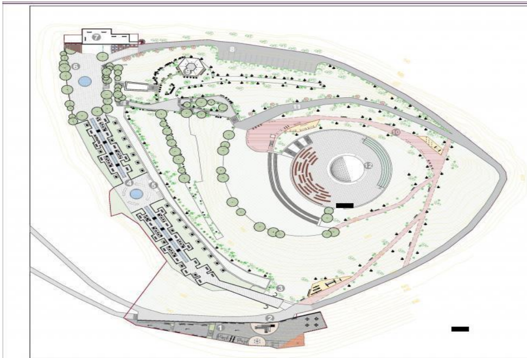
Figure 10 Marked place where the relics of the fallen fighters are kept

The relics of the fallen fighters are transferred and stored in a coffin in a small room, 5 m 2 , located at the far eastern part of the Memorial and protected by an iron door.