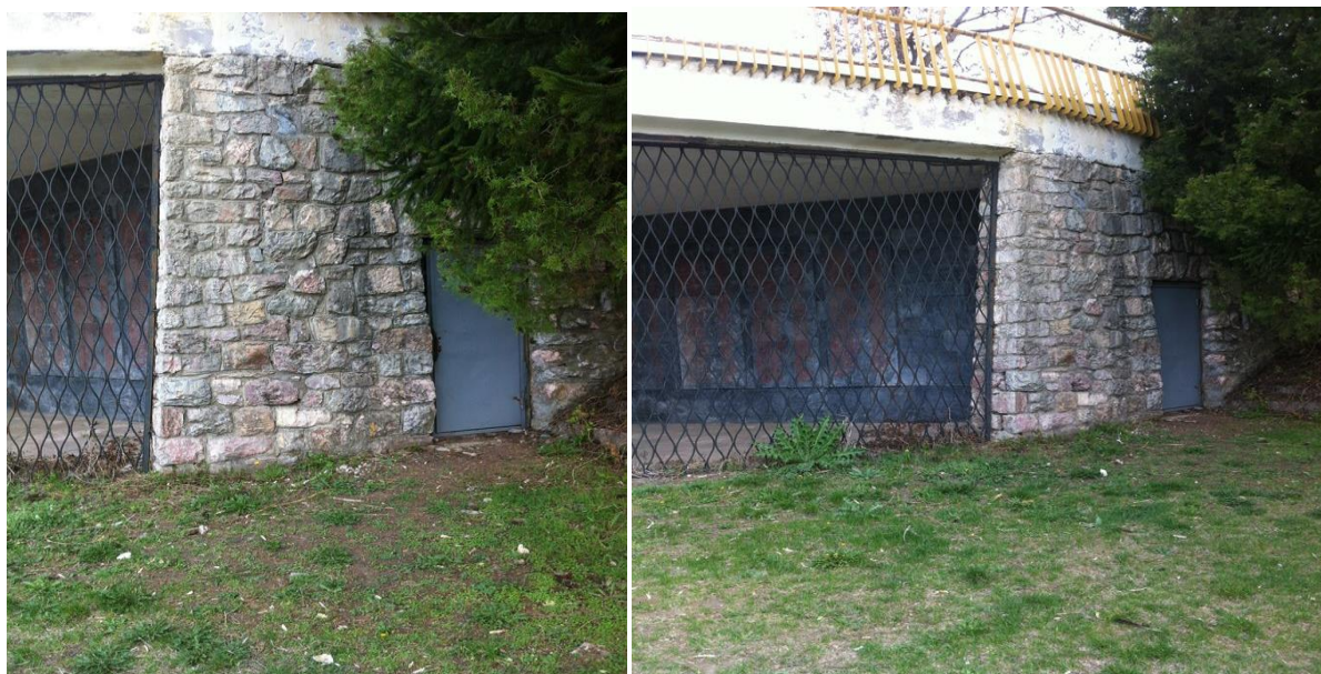
Figure11/12Door from the room where the relics are kept

Twelve years ago, the Municipality of Kichevo in cooperation with the NU-Skopje Conservation Center repaired the plaques on which the names of the fallen fighters were engraved and partially protected the plateau over them. A drainage channel was constructed (placed) for atmospheric waters in order to reduce and prevent further damage. However, due to inefficiency and lack of control over maintenance in Kitino Kale, the problem was repeated, thus there is a danger of re-ruining the mentioned slabs. Namely, the grids are stolen, and the channel is clogged, which again creates a problem that affects damage to the building, such as slabs with engraved names of fallen fighters and the ceiling of the building.