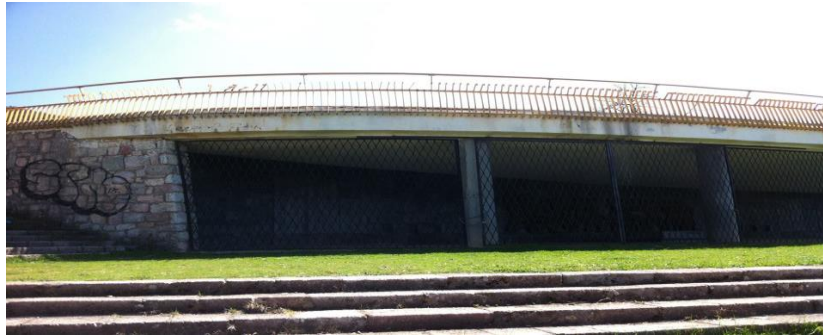
Figure 6 Memorial ossuary

attendance from the local population (citizens) and tourists. The summer open stage will be placed on the top of the plateau above the Memorial Monument of the National Liberation War (NLW).