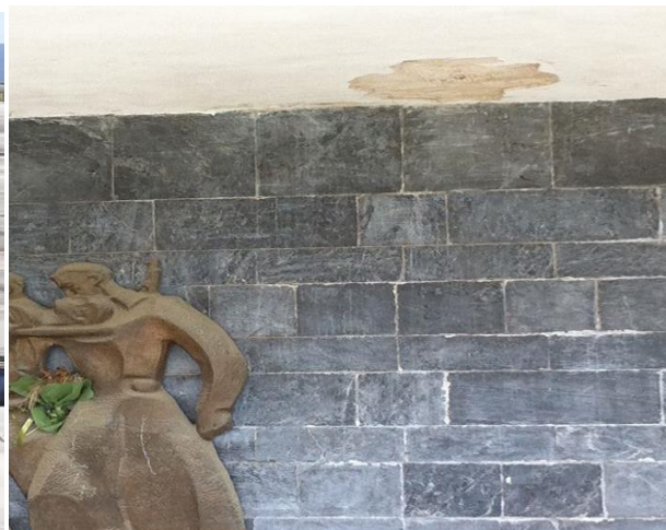
Figure13 Drainage channel for atmospheric waters Figure 14 Damaged ceiling