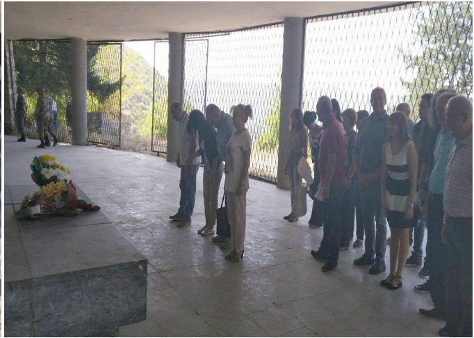
Figure 9 Celebration of September 11

The relics of the fallen fighters are transferred and stored in a coffin in a small room, 5 m 2 , located at the far eastern part of the Memorial and protected by an iron door.