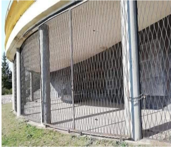
Figure 8 Memorial Monument